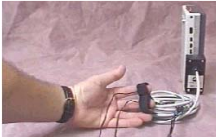
GSR100C shown with MEC100C and TSD203