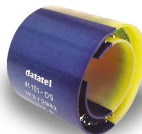
Single channel telemetry transmitter for drive shaft installation