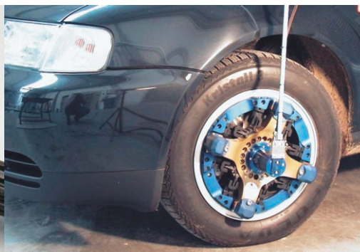
6-component wheel force transducer with telemetric data transmission