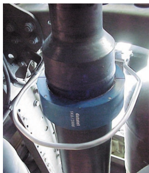
Torque measurement on cardan shafts