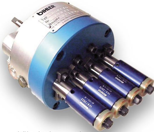
4-way drill head with integrated torque measurement to monitor the tapping process

Turnkey telemetry systems for measurement and wireless transmission of physical parameters on rotating tools and tool machine components e.g.: