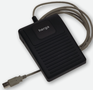
The 6210-0084 is a stock model