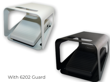
With 6202 Guard