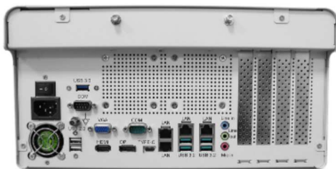
USB 2.0 x2 / USB 3.0 x2 (optional)