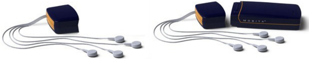
Mobita ConfiCap Connection