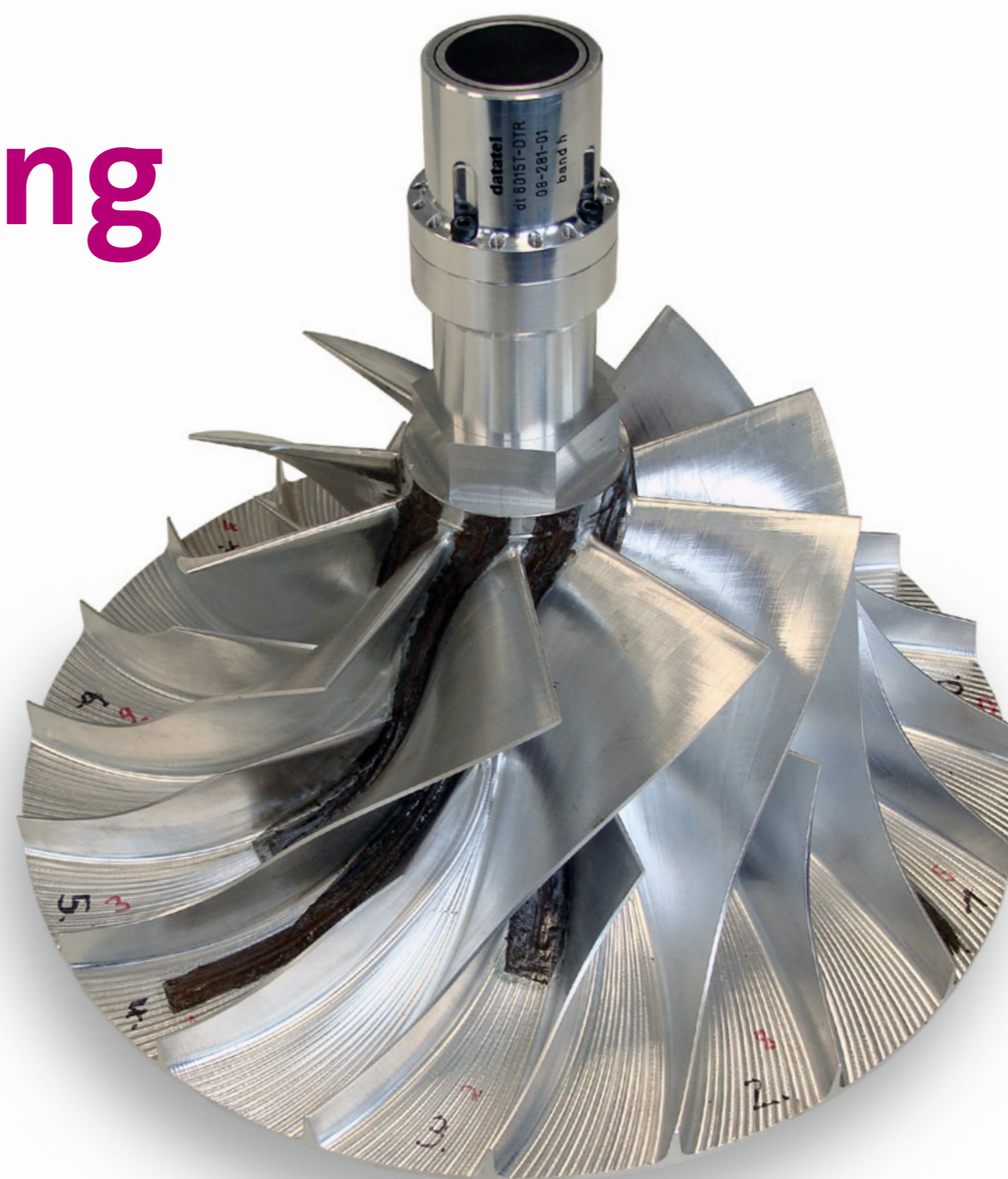
Instrumented Compressor Rotor